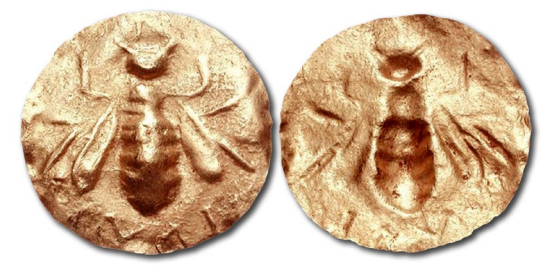
Obol: The coin for paying Charon

Charon, the ferryman of souls, after receiving the obol (which was already placed in the mouth of the dead) carried the soul to the entrance of the underworld. The souls that could not pay the obol were doomed to wander eternally on the riverside.